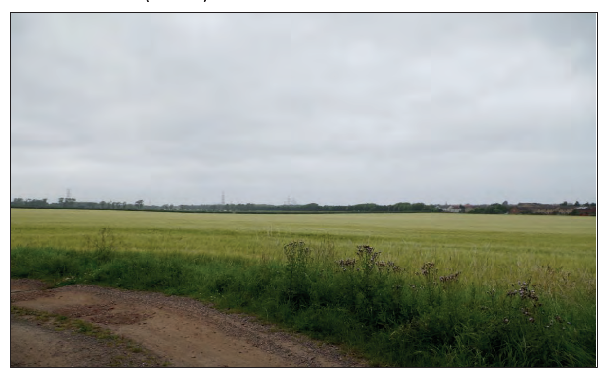
Plate 8: Intermediate view facing west from location 250m to west of Seton Collegiate Church (WA 1357) across open fields to vegetation that obscures Onshore Substation Site