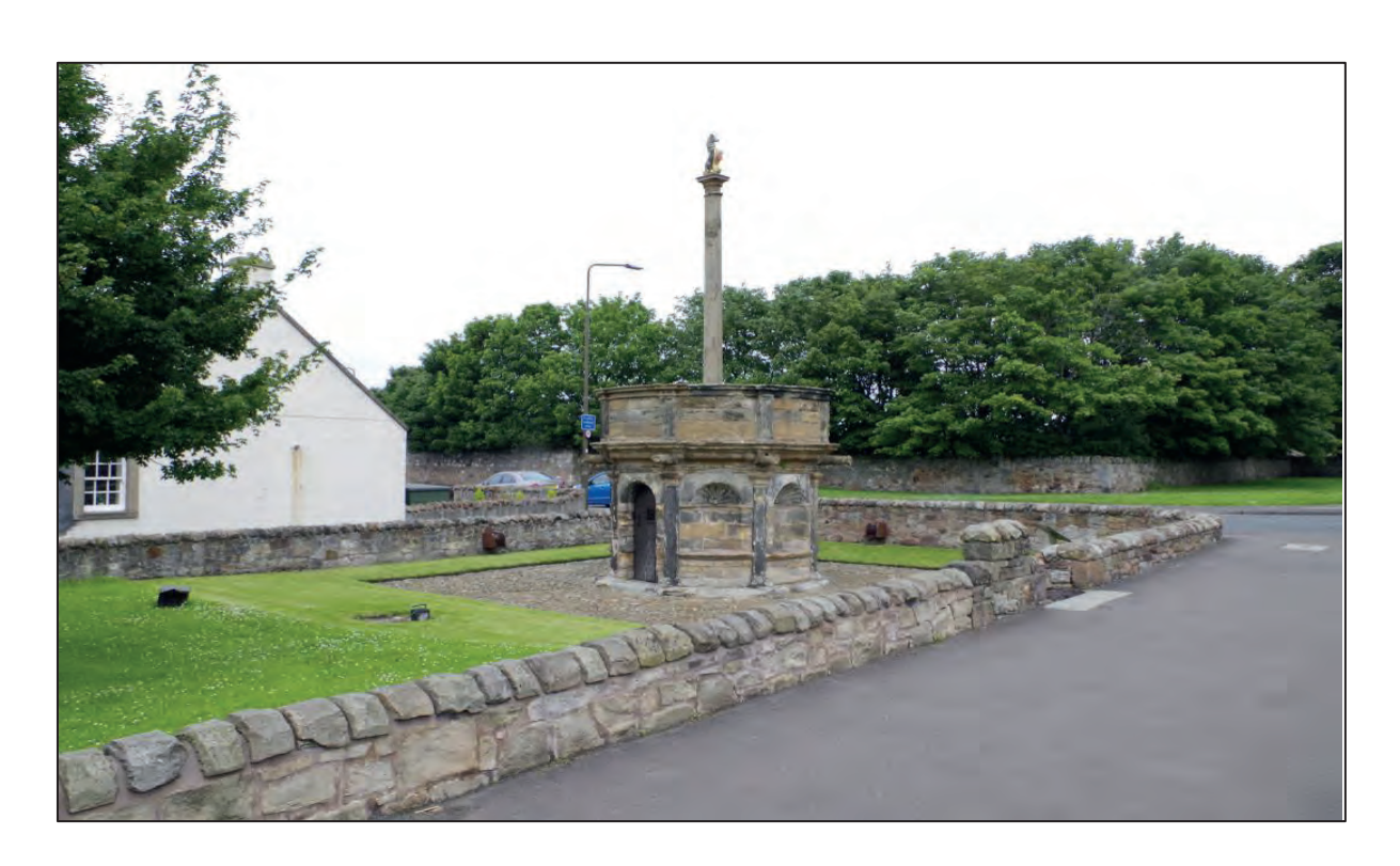
Plate 5: Preston Mercat Cross (WA 1176), looking northeast towards the Onshore Substation Site, showing lack of intervisibility