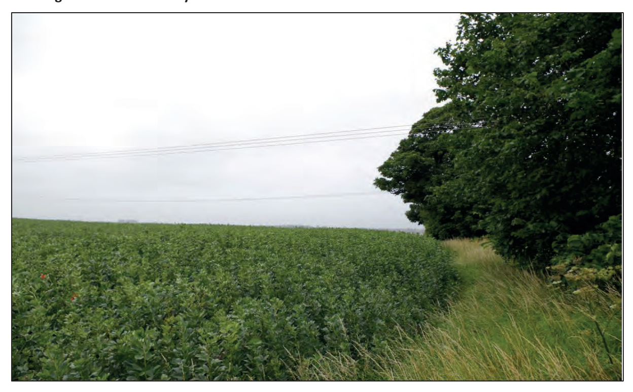
Plate 6: View northeast from Birsley Brae (WA 1182) looking towards Onshore Substation Site