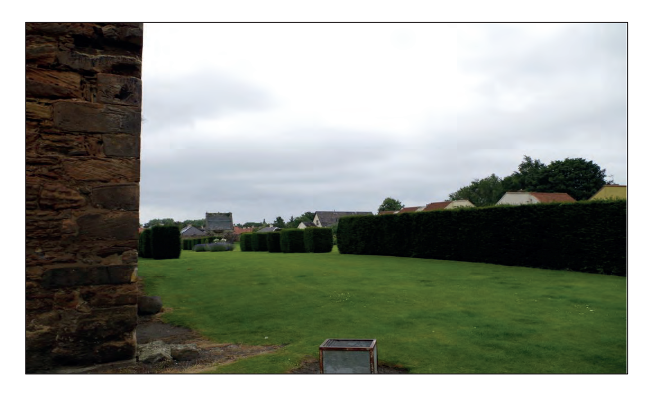
Plate 7: View from Preston Tower (WA 1163) northeast towards Onshore Substation Site, with Preston Tower Doocot (WA 1160) in shot