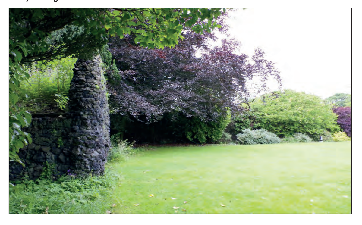
Plate 2: Cockenzie House Grotto (WA 1234) looking west showing enclosed nature of surrounding gardens