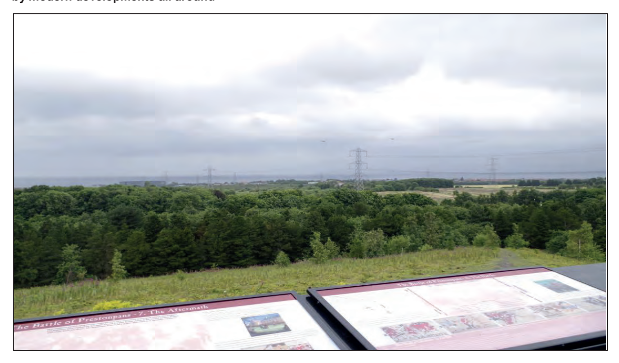
Plate 10: View looking north-northeast from viewpoint for Prestonpans Battlefield (WA 1351) across Inventory Battlefield area, with Onshore Substation Site in the northeast