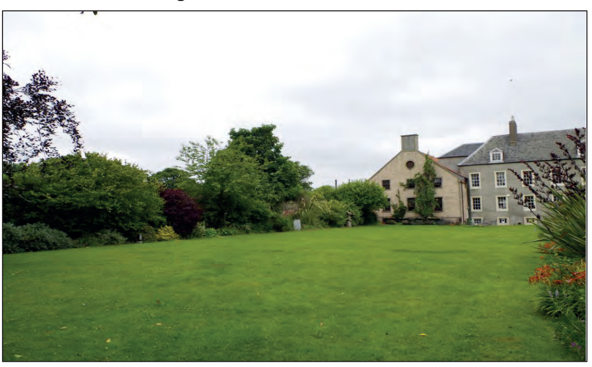
Plate 1: View from Cockenzie House and Gardens (WA 1231, WA 1234, WA 1235 and WA 1236) looking northwest towards Onshore Substation Site