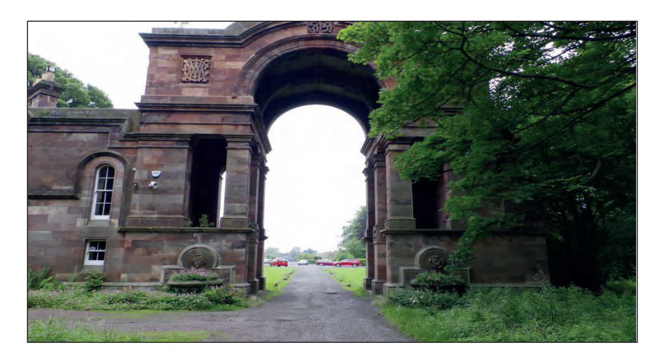
Plate 3: View west from Gosford House Gate Pillars (WA 1457) showing no intervisibility with Onshore Substation Site