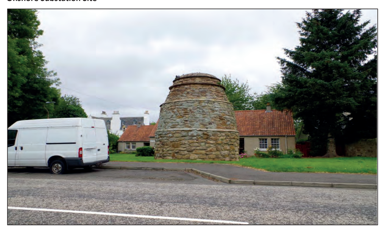
Plate 4: View north-northeast from Northfield House Doocot (WA 1155) showing no intervisibility with Onshore Substation Site